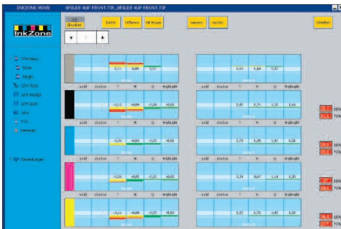
InkZone Move Digital & Flexo: all relevant data for the process run and quality checks are displayed within seconds.

IZM Digital & Flexo is the only solution on the market that requires a single, comparatively-inexpensive, scanning device for both manual and automatic measurements. Unlike many other solutions in the market, IZM Digital & Flexo is specifically tailored to the needs of flexo and digital printers in order to maintain high quality with an uncom-